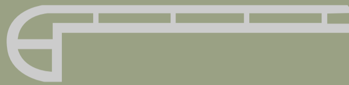
Flush stair nose B 2400x115x25mm Escalón empotrado B 2400x115x25mm